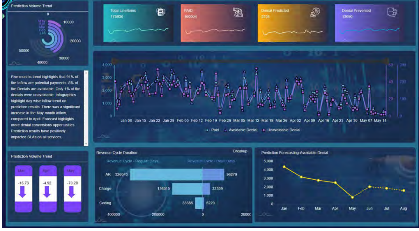
Figure 2: NTT DATA Denial Management AI Platform