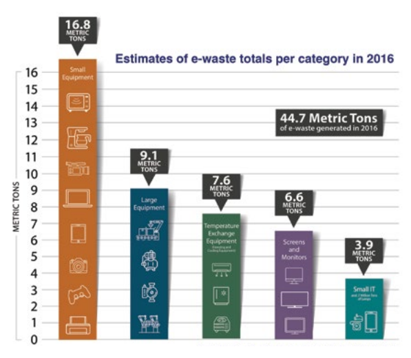
Estimate of e-waste totals in 2016 per category<sup>9</sup>

On the other side of the coin, IoT has the promise to greatly reduce raw material demand in many areas, such as household appliances, large machinery, lighting and more, because it helps us produce smart devices that alert users to required maintenance and impending failures. This helps reduce complete disposal (which fills landfills with complete appliances, machinery and more) over smaller parts replacement.